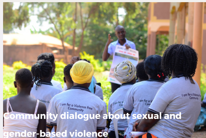
Community dialogue about sexual and gender-based violence

Village Health Team (VHTs) members supported with Personal Protective Gear Equipment.