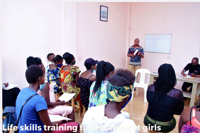
Life skills training for adolescent girls

Youth who restarted received entrepreneurship and business education, coaching and mentorship and restarted their businesses when total Covid 19 lockdown was lifted