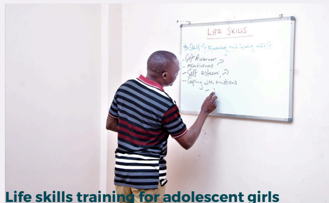
Life skills training for adolescent girls

Men, women, adolescents, children received quality and affordable health services and education from our health centre.