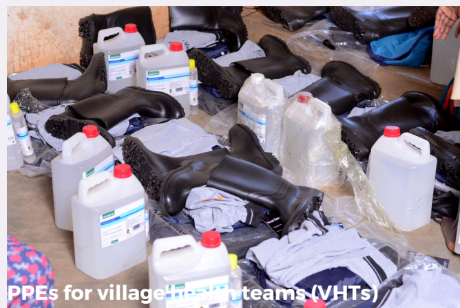
PPEs for village health teams (VHTs)

Low-income households ( families headed by the elderly, families headed by children, those with HIV+ members, those with disabled persons etc) that received monthly financial support to meet their basic needs.