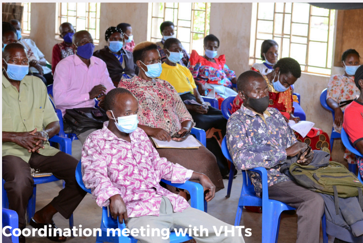
Coordination meeting with VHTs

Microcredit funds dedicated to restoring youth-led businesses that were lost or disrupted due to the effects of Covid 19.