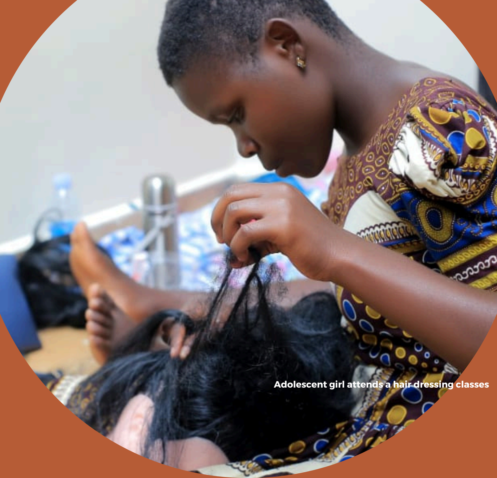
Adolescent girl attends a hair dressing classes