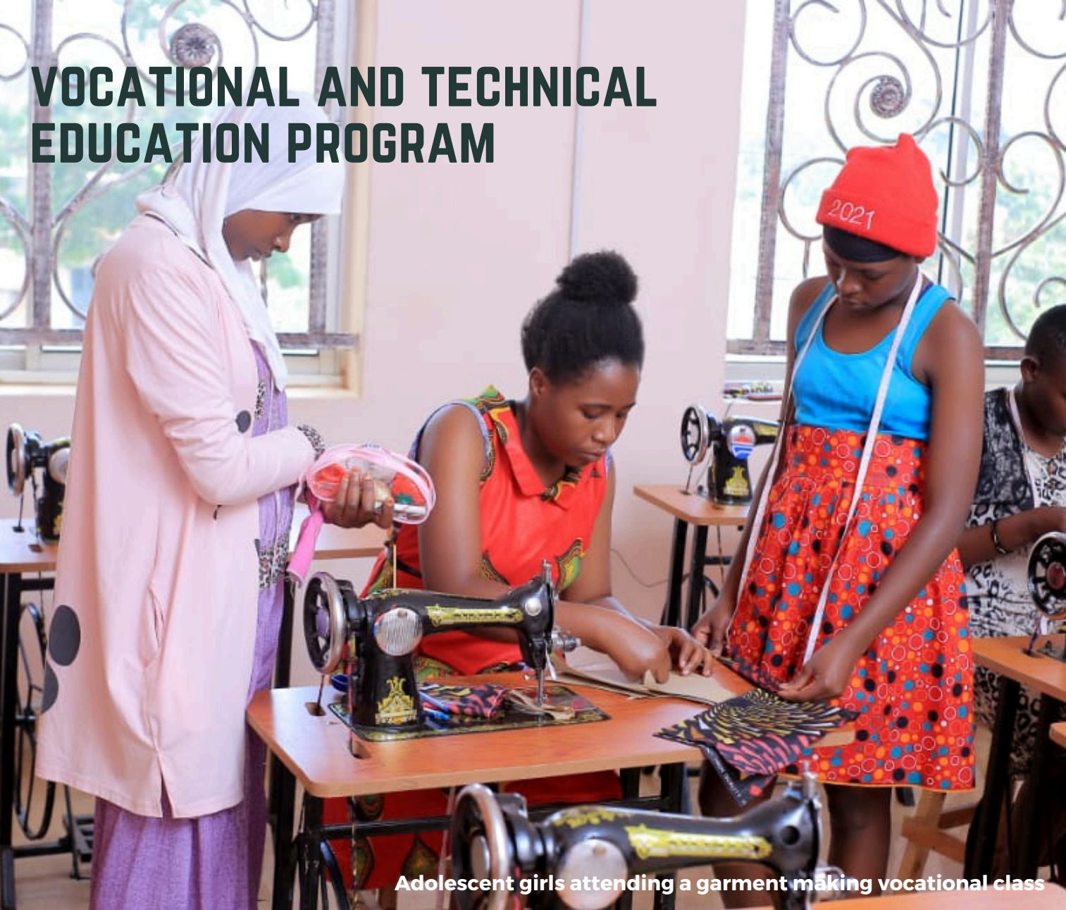
Adolescent girls attending a garment making vocational class

The Covid 19 pandemic has disrupted education and the outcomes so far are worse for girls than boys. Gender-based violence has predominantly affected girls and women in droves with over 3,000 cases registered by police between March-October 2020. The chances of girls who were in school before March 2020 going back have drastically reduced, and in the long run, their social, economic and political participation is compromised.