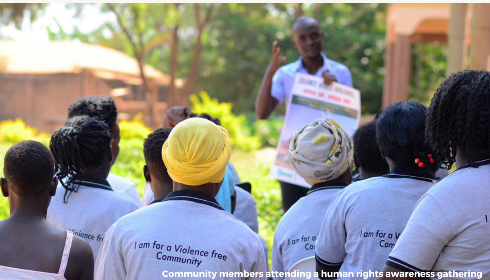
Community members attending a human rights awareness gathering

"When families were locked up at home during the Covid 19 total lockdown measures, violence against women and girls was on the rise. In rural communities, more than 12,000 unplanned pregnancies were registered by public health facilities in 2020. These and many other challenges prompted YETU to organise community dialogues and human rights awareness to ensure women and girl children were protected and safeguarded. We designed and disseminated human rights information materials including 500 shirts, 1000 posters about the dangers of gender-based violence and conducted 3 dialogues in the last quarter of 2021 facilitated by health workers and local leaders. the dialogues and materials reached over 500 community members.